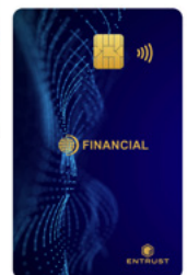
Durable Graphics Printing

Learn more about the Sigma DS4 printer at entrust.com