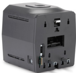
Light Curing Module

The Light Curing Module seamlessly integrates into existing Sigma DS4 systems and applies a unique, UV-curable, thermal transfer, monochrome graphics ribbon to pre-printed cardstock using 300x600 dpi printing technology. This bright, bold, and durable personalization option stands out in its clarity and toughness compared to other direct-to-card flat card personalization options available in the market.